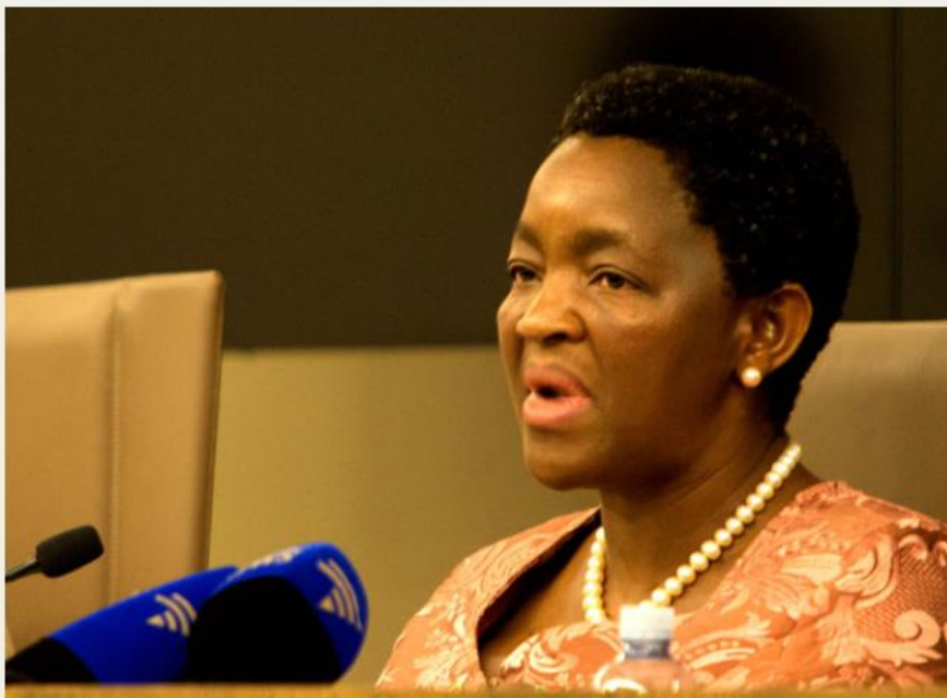
Bathabile Dlamini.